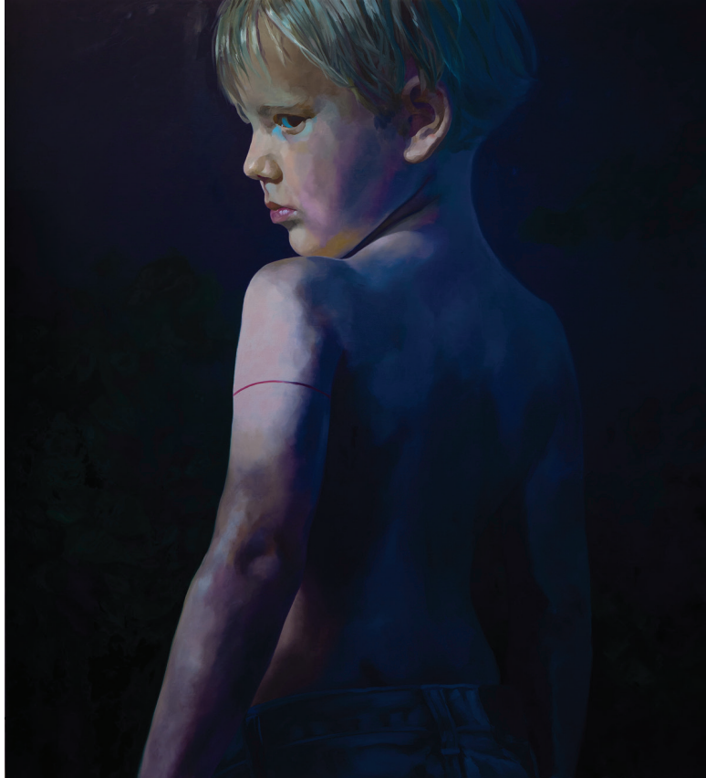
Markus Åkesson, The Woods II , oil on canvas, 67x59 inches, 2012