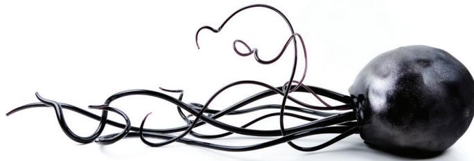
Markus Åkesson, Xenos , glass sculpture, L: 55 inches, 2011