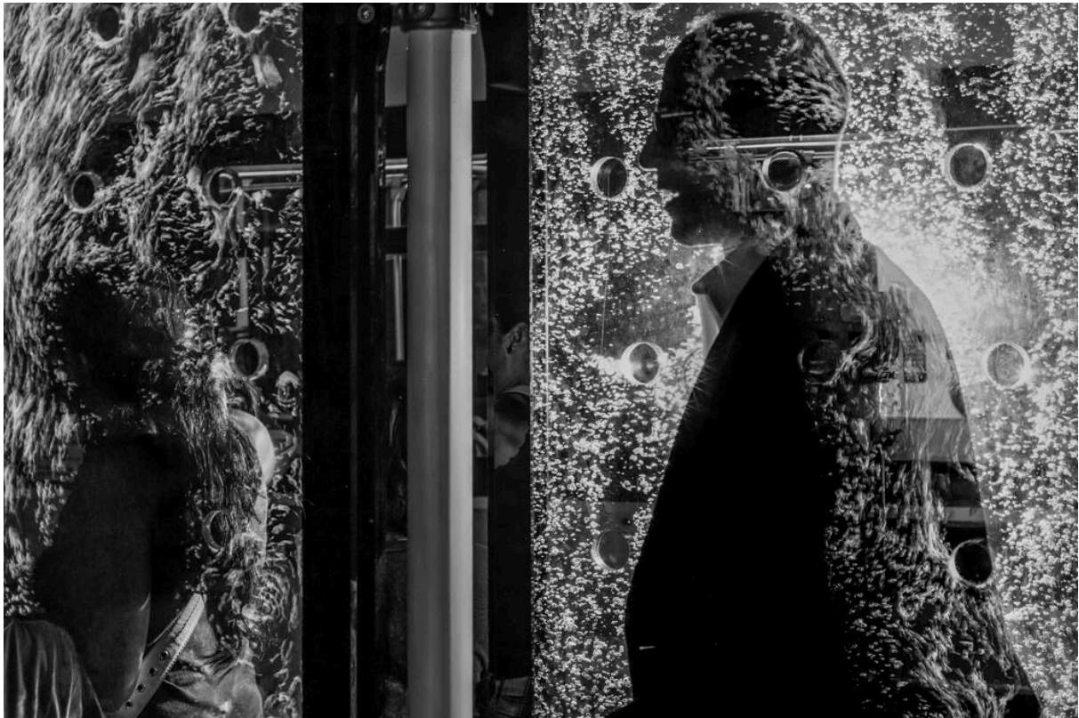
© Satoki Nagata, Experimental image, Chicago, 2014

November 8th through December 20th, 2014